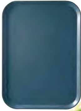
Slate Blue (401)