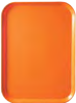
Orange Pizzazz (222)