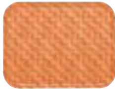
Light Basketweave (302)