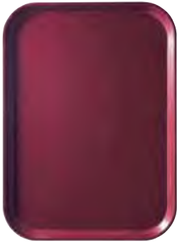
Burgundy Wine (522)