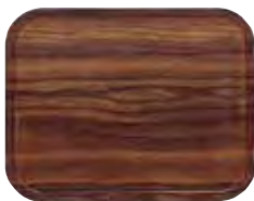
Burma Teak (308)