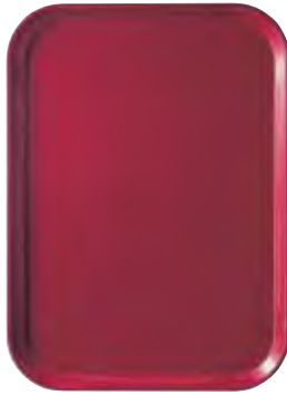
Cherry Red (505)