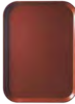
Real Rust (501)