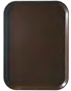
Brazil Brown (116)