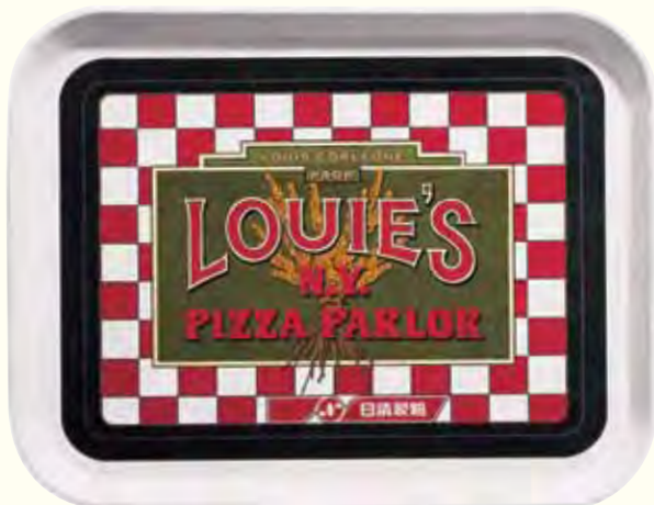
FOUR COLOR PRINTING PROCESS

Personalize Camtrays to display a message with every tray served. Advertise a product, promote your business, enhance patient satisfaction or strengthen school spirit.