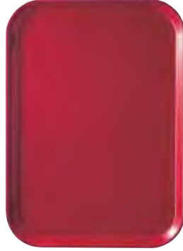
Ever Red (221)