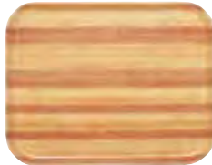
Light Butcher Block (303)