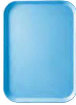
Robin Egg Blue (518)