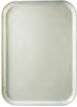
Antique Parchment (101)