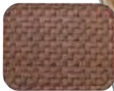
Dark Basketweave (301)