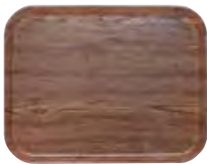
Country Oak (304)