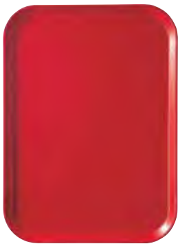
Signal Red (510)