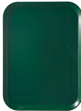
Sherwood Green (119)