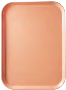
Dark Peach (117)