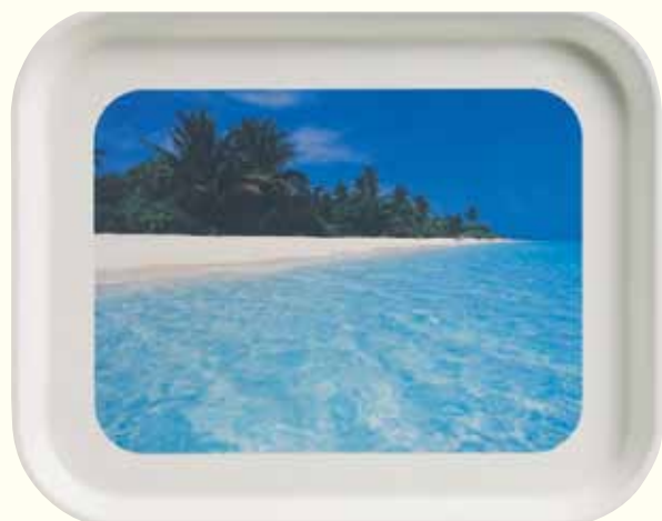
FOUR COLOR PRINTING PROCESS