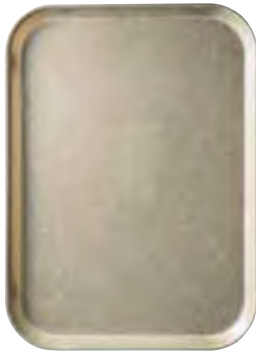
Desert Tan (104)