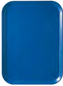
Amazon Blue (123)