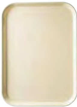
Cameo Yellow (537)