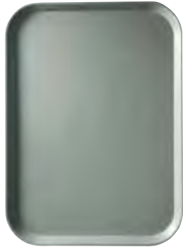
Pearl Gray (107)