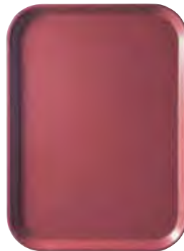
Raspberry Cream (410)