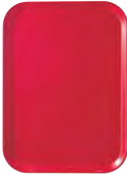
Cambro Red (521)