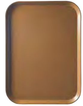
Suede Brown (508)