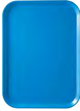
Horizon Blue (105)