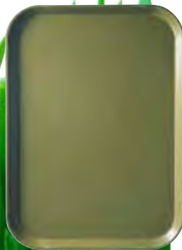
Olive Green (428)