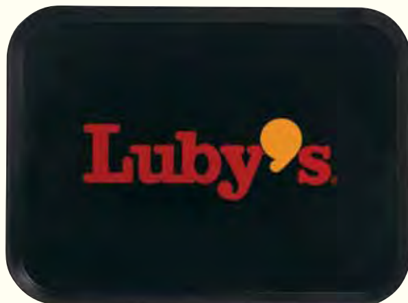
SCREEN PRINTING PROCESS