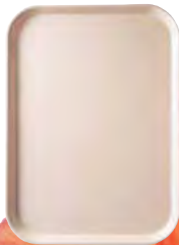
Light Peach (106)