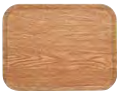
Light Elm (307)