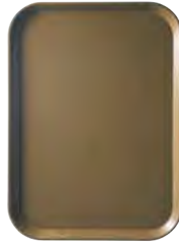
Bay Leaf Brown (513)