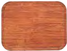
Java Teak (309)