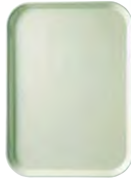
Key Lime (429)