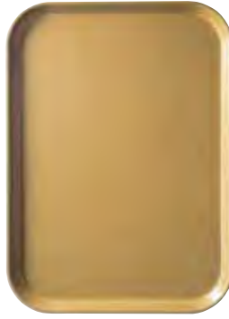
Earthen Gold (514)