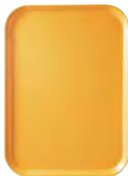
Tuscan Gold (171)