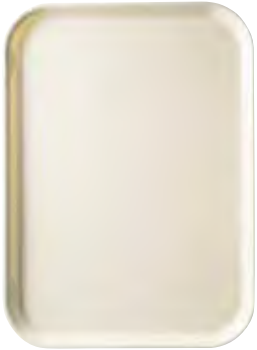
Cottage White (538)