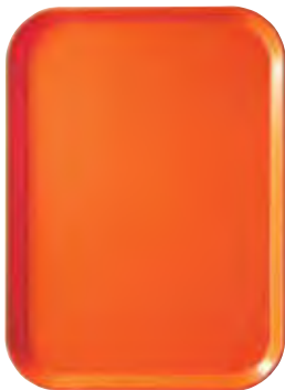
Citrus Orange (220)