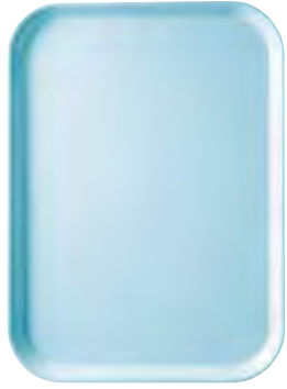
Sky Blue (177)